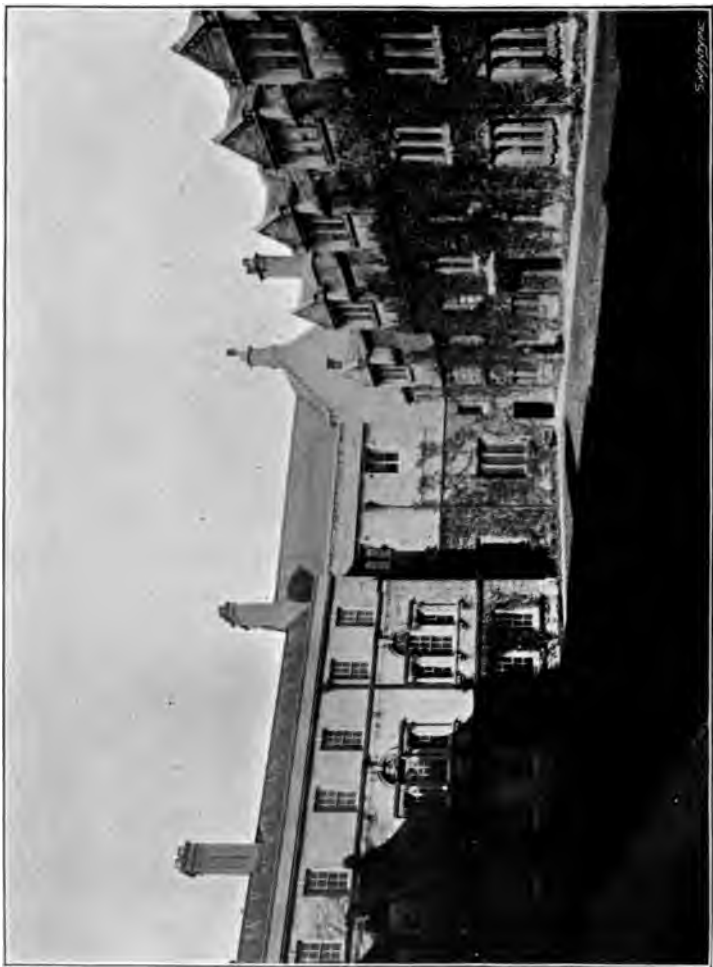
From a photograph by the